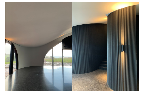
Residential over $100K winner 2022 Midway Plaster Pty Ltd