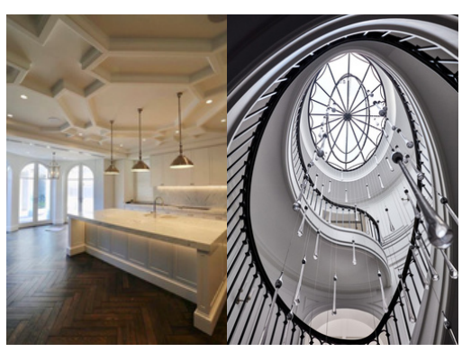
Best Decorative Winner 2022 Clean Plaster